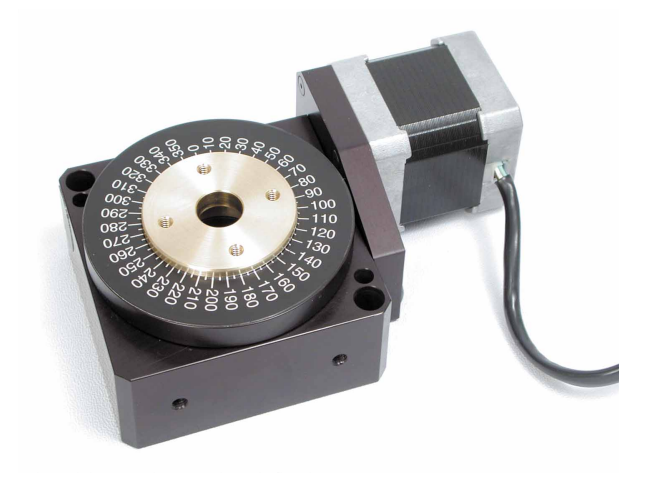
Model B5990TS A 1.7" diameter table with a gear ratio of 90:1