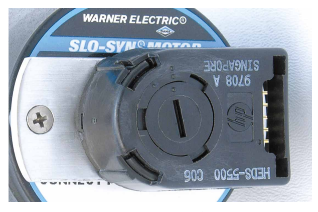
Rotary encoder mounted to motor shaft extension