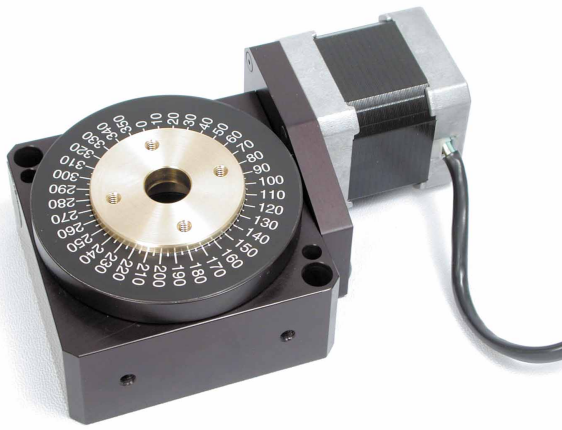
Model B5990TS A 1.7" diameter table with a gear ratio of 90:1