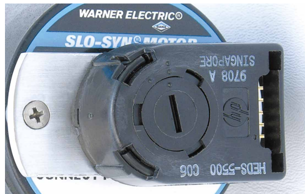
Rotary encoder mounted to motor shaft extension